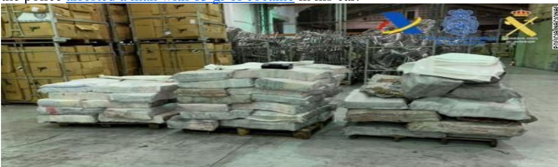
Spanish police have seized more than two tons of cocaine and arrested 12 people

Balkans ( January 17 to 24, 2021 ): Spanish police seized more than two tons of cocaine and arrested 12 people involved in a large scale drugs smuggling network with connections to Paraguay and Brazil. The drug landed at the port of Algeciras in southern Spain from South America hidden in charcoal shipments. Meanwhile in Tirana, the capital of Albania, the police arrested a man with 63 gr of cocaine in his car.