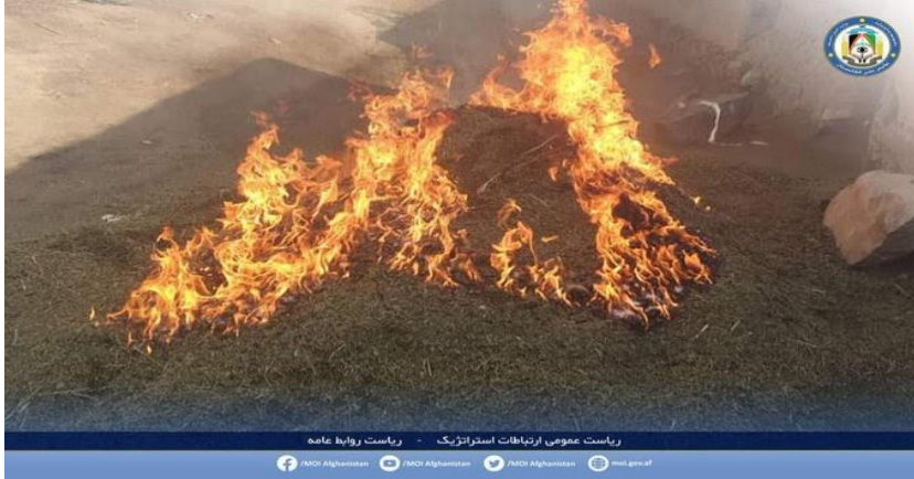
45 tons of hashish torched.

radio handset & two hand grenades, two drug traffickers were killed.