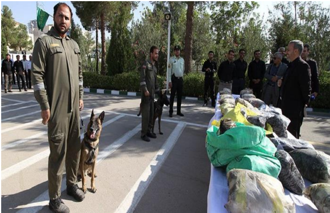
Drug seizure in Saravan and Mehrestan counties, Iran.

during the month of January include huge drug seizure and numerous arrests. 3rd of January was an important day in terms of drug seizure in Iran, during which two separate operations were launched by police forces and consequently huge amount of drugs have been seized in Saravan and Mehrestan counties: in one case 1,716 kilograms of opium as well as some weapons and ammunition were captured, while in the second the police seized 377 kg of opium together with some weapons. In relevant remarks last week, Brigadier General Taheri said that approximately 2.5 tons of various kinds of illicit drugs have been seized in four separate operations in Sistan and Baluchistan province (see picture). On January 20 a significant amount of drugs including 150 kg of opium together with 101 kg of hashish seized in the northern province of Gulestan. The drugs have been found in the residential house of the suspect.