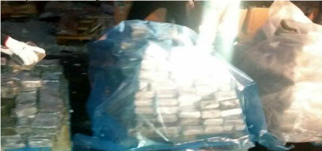
Border police seized 613 kilos of hashish landed to the port of Livorno from Spain

operation with the border police seized 613 kilos of hashish landed to the port of Livorno from Spain, while arresting two Italian citizens. See picture