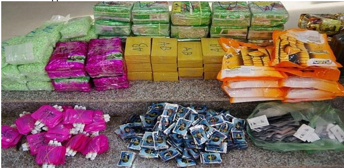
Drugs from Cambodia are busted by authorities of Dong Thap Province, January 17, 2021.

In spite of the fact that Vietnam has one the strictest laws on drugs, the movement of drugs sounds unstoppable.