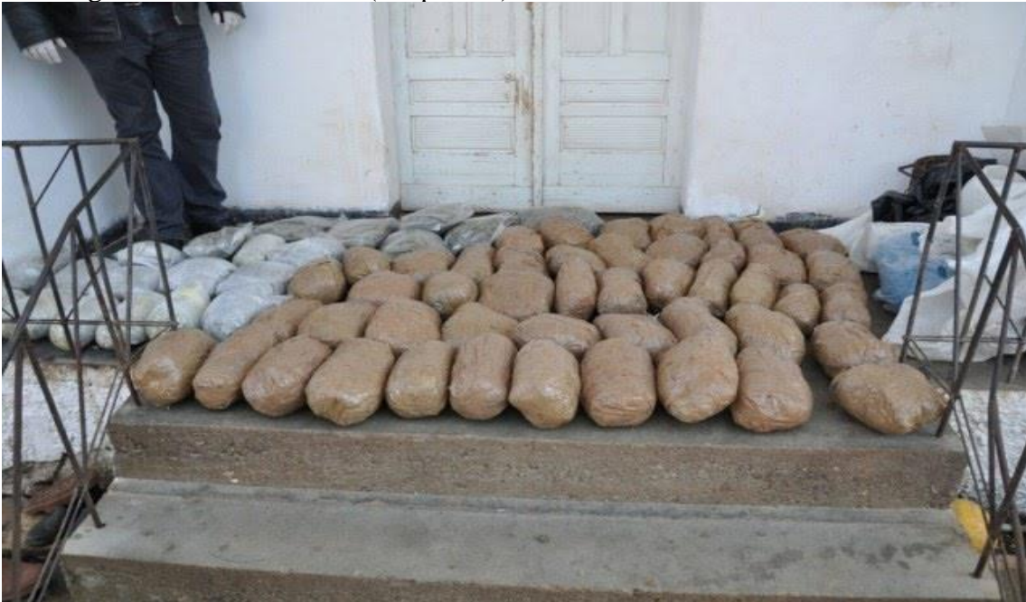
London police seized 4 kg of cocaine and 340,000 £ in cash, while arresting four Albanian citizens

Balkans (January 10 to 16, 2021): In the southeastern province of Korce the police arrested 2 people with 21.5 kg of cannabis , while in Tirana, the capital of Albania, a man was arrested with 14 kg of cannabis . Further, in the Albanian - Greece border the police arrested a person with 35.880 kg of marijuana . Lastly, during a large anti-drug operation conducted in London, the police seized 4 kg of cocaine and 340,000 £ in cash, while arresting four Albanian citizens(see picture).