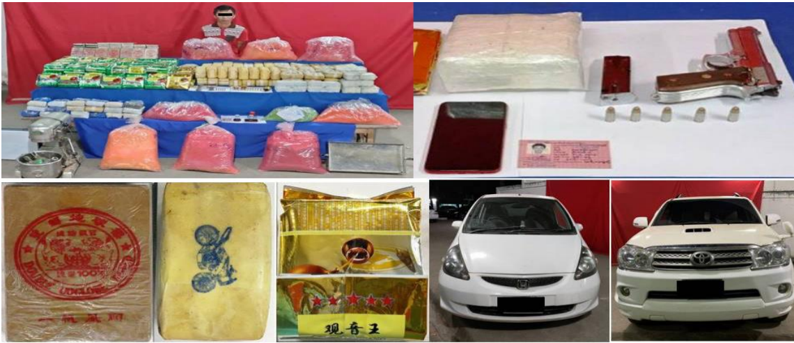
သိမ်းဆည်းရမိသည့် မူးယစ်ဆေးဝါးများ၊ ဆက်စပ်ပစ္စည်းများ၊ လက်နက်/ခဲယမ်းများနှင့်အတူတွေ့ရမည့် 1.7 million meth tablets, 58kg powder, 86.5kg crystal, in Tachilek Shan

tablets in South Shan and 1.7 million meth tablets, 58kg powder, 86.5kg crystal , in Tachilek Shan (see photo).