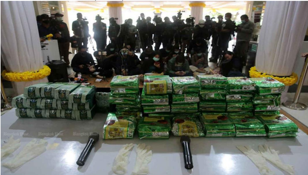
30kg of crystal methamphetamine and 15kg of ketamine were seized by Thai police forces. Photo: Chanat Katanyu ).

In January a fatal variant of a drug cocktail known as the "powdered milk ketamine" (K-nom pong) emerged in Bangkok, on 10 January the drug took the lives of 7 individuals in Bangkok. On 13 January 30kg of crystal methamphetamine and 15kg of ketamine were seized by Thai police forces (see Photo by Chanat Katanyu ). The drugs originated in the North and were seized in Kamphaeng Phet. According to Bangkok Post , 'Gangs in Taiwan, China and Thailand have colluded to smuggle ketamine into Thailand for re-export to lucrative markets in Malaysia and Hong Kong, a source in the Office of the Narcotics Control Board (ONCB) has revealed.