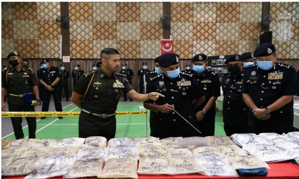
Drug seizure by Johor Baru police.

Malaysia: On January 17th the biggest narcotics seizure in Malaysia's history took place (see photo). The Johor Baru police launched coordinated raids surrounding the city for two days (14 and 15 January) leading to the seizure of 3.2 tones of Ecstasy powder worth RM192 million, 26.1kg of liquid Ecstasy worth RM939,600, and 117kg of Eramin 5 powder worth RM8.7 million . Moreover, according to Johor police chief Commissioner Ayob Khan Mydin Pitchay, 'besides the chemical products, police also seized various machines and tools used by the syndicate, as well as four vehicles worth RM960,000. He added that the machines and tools were imported from China, including the raw materials for producing the drugs, which could last for about three years. Two (Johor Baru) locals were arrested in connection to the case. Commissioner Ayob Khan added that "The raids on Thursday and Friday were part of a follow-up investigation following a drug bust between Jan 9 and 10, which led to the arrest of 15 suspects. "Four of the 15 suspects informed the police about the locations where they stored the drugs, which led us to one factory and two houses, which the syndicate had been renting since 2018 to carry out its drug activities, ".